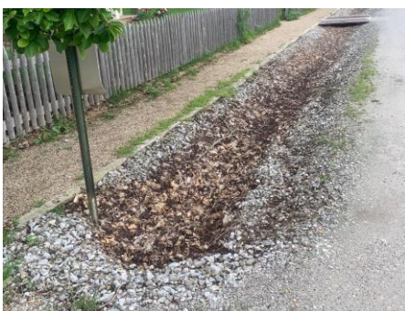
Fig. 2 - Existing conditions along Hyde St. looking North.

Illinois Extension received a grant from the Extension Disaster Education Network (EDEN) for green infrastructure projects to support the purchase of plants and mulch.