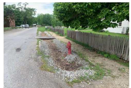
Fig. 3 - Existing conditions along Hotchkiss St. looking West.