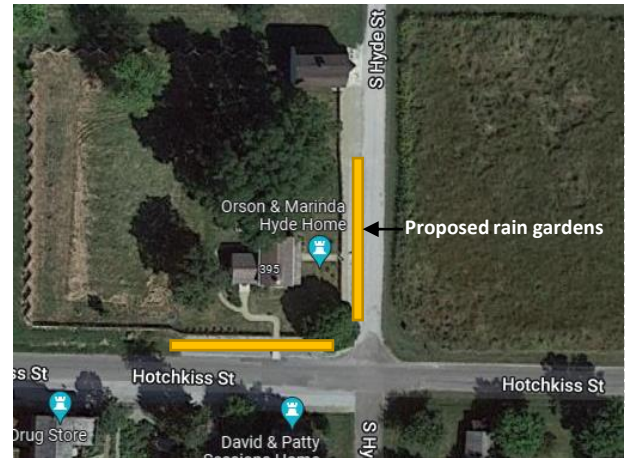
Fig. 1 - Proposed rain garden locations along two streets in Historic Nauvoo.

The existing conditions of the site was a graveled ditch. In an effort to soften the landscape, encourage more infiltration of stormwater, and high visibility the team decided this was an ideal location for a rain garden.