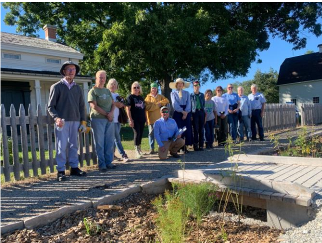
Fig. 4 - Rainscaping participants line up for a photo after installation of the rain garden.