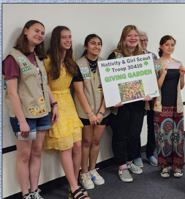
Girl Scout Troop 30410 will donate produce to the food pantry and soup kitchen