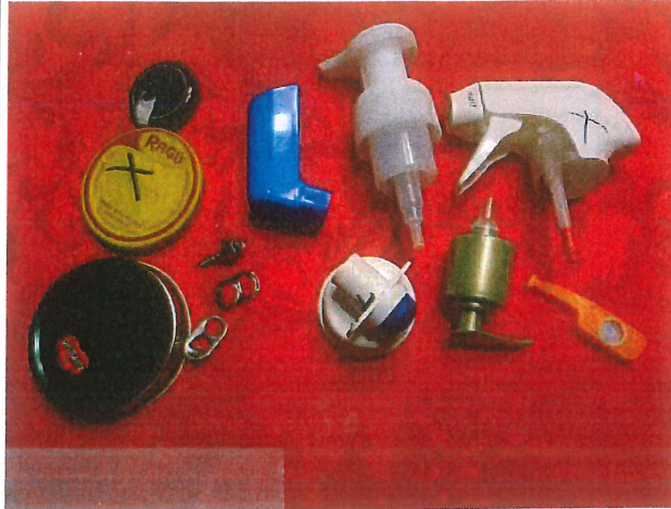
Metal Of Any Kind with the plastic, Soap Pumps, Lotion Pumps & Trigger Sprayers