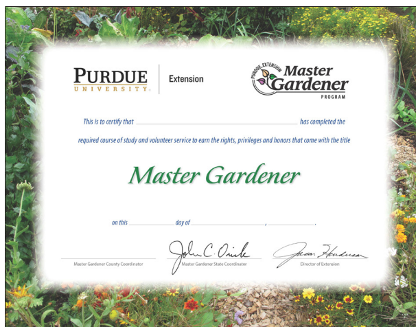
Purdue Extension Master Gardener Certificate for certified EMG level.

After completing the volunteer commitment of at least 40 hours, EMG Interns will receive, from Purdue University through their county coordinator, a certificate that verifies they completed the Purdue EMG Program requirements.