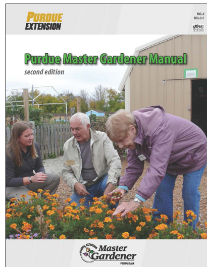
Purdue Extension Master Gardener Manual in print and digital

Basic training participants receive a copy of the Purdue Master Gardener Manual (available in print and digital formats), which is a comprehensive reference about many horticultural topics related to Purdue EMG Basic Training. This reference also includes questions EMGs may receive from the public with examples of appropriate responses. This manual will be a valuable resource for volunteers.