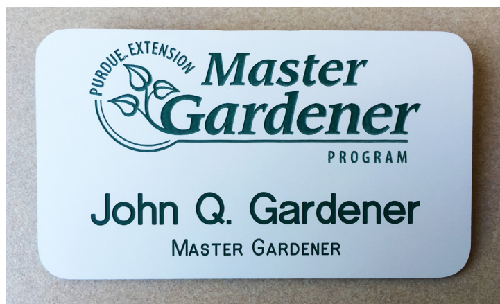
Purdue Extension Master Gardener Badge for the initial certification level.

Additional advanced EMG certification levels include Bronze, Silver, Gold, and Platinum. The Gold level further recognizes those who have volunteered 1,000, 2,000, 3,000, 4,000, and 5,000 hours and Platinum levels recognize volunteers contributing 6,000, 7,000, 8,000, 9,000, and 10,000 volunteer hours. EMGs will be awarded certificates and name badges for each level achieved through their volunteer activity and training.