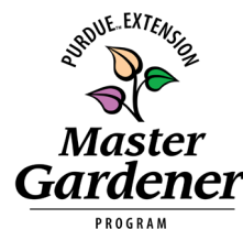
Purdue EMG logo designed for social media use.

The Purdue EMG logo may be used in either black, white, dark green (Pantone Green 342 CVU) and cream (4545 CVU), or color leaves with black print. The "Master Gardener" font is ITC Leawood, and the "Purdue & Program" font is Berliner Grotesk. Do not alter the logo in any manner other than to adjust the size. "Helping Others Grow" and/or a county name or association name may be added to it (above or below). Purdue EMG activities must also follow Purdue Extension guidelines including branding and EEO statements (see Purdue Extension Brand Basics, available from the Purdue Extension Communication and Marketing Resources website, www.ag.purdue.edu/extension/communication ).