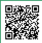
Mini Monday QR Code