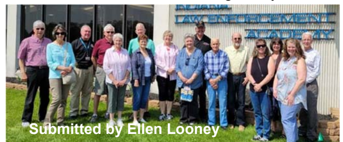
Submitted by Ellen Looney