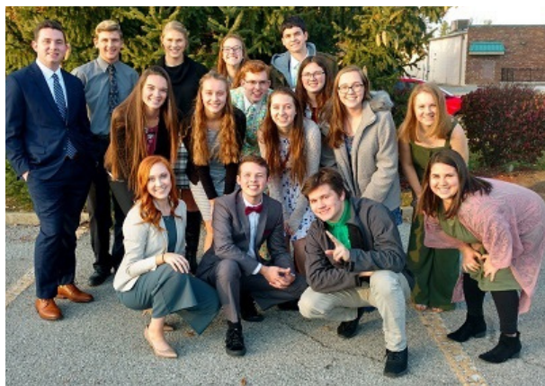
Members of the 2020 State 4-H Junior Leader Council