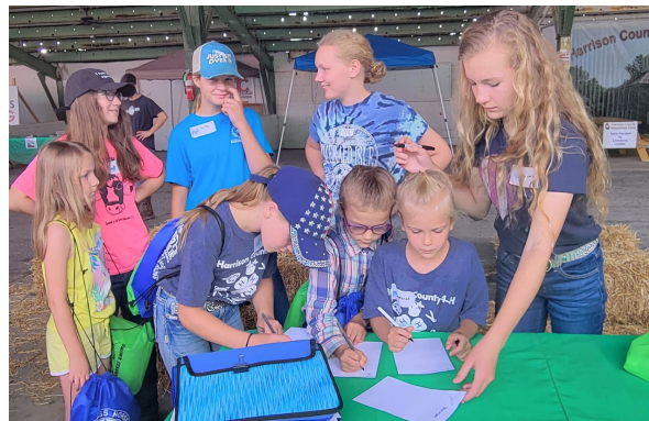
Youth that had just participated in a clinic at the fair start writing thank you notes the organizations and volunteers that helped made the experience possible.

Please be sure to thank everyone who has positively impacted you this year. This includes adult 4-H volunteers, club leaders, superintendents, coaches, committee members, council members, fellow 4-H members, parents, sponsors, office staff, educators, or anyone else who has helped you this year!