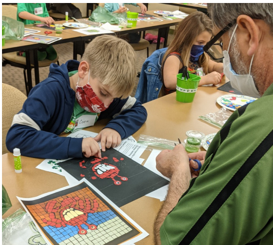
Mini 4-H Member crafting at the Making Mosaics Workshop!

Sign your child up online at v2.4HOnline.com !