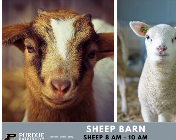
SHEEP 8 AM - 10 AM GOAT 8 AM - 10 PM

Sheep and Goat Tagging Saturday May 7th 8 AM until 10 AM