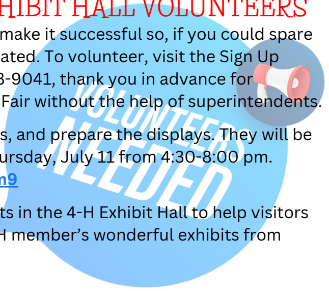
Exhibit Hall Volunteers - https://tinyurl.com/mr2x5wj5

We are also in need of volunteers to work two hours shifts in the 4-H Exhibit Hall to help visitors find an exhibit they are searching for and to keep our 4-H member's wonderful exhibits from getting damaged from curious hands.