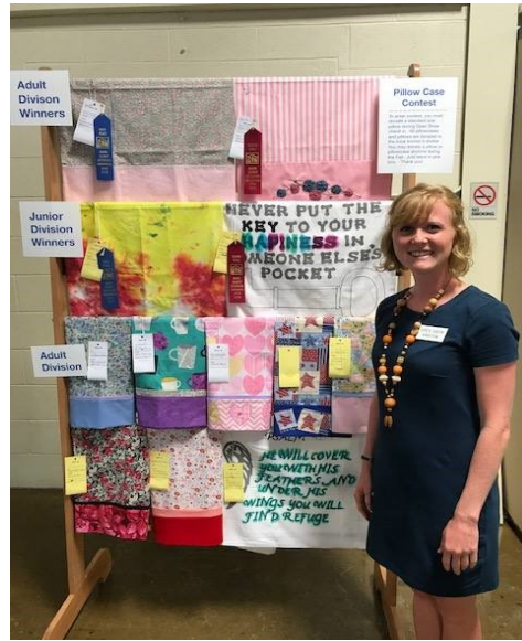
Pillow Case Entries – BCEH Open Show