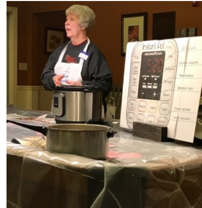
Home Cooking Club

The three figures depict the endless combination of family members, representing male and female, adult and child. The letters, IEHA, form an important portion of the home by providing support. The roof of the home extends beyond the perimeter of the design, indicating that the influence of IEHA extends beyond the home and the family to the surrounding community