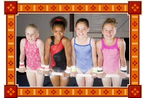
Which stands out?

You may want to "mat" or frame your photo. It is the same principle as framing a picture you would hang on the wall. By placing an additional layer of paper or card stock around your photo it will make it stand out and look more professional.