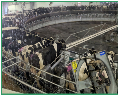
In the 100 stall rotary parlor, cows are milked 3 times a day.

Mini 4-H'ers were on the moo-ve in April! A short bus ride to Freeland Dairy in Earl Park was a great way to spend a beautiful evening learning about the dairy.