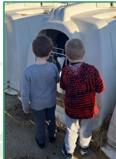
Visiting the calves was the best part of our tour!