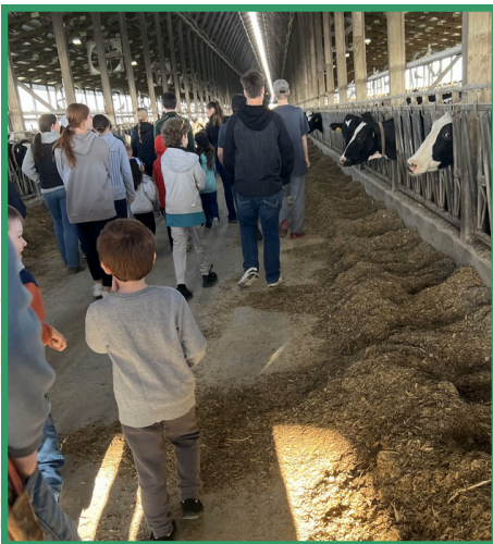
We had the opportunity to tour one of the freestall barns and learn about how the cows are cared for.