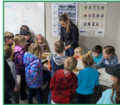
Feed is mixed on-site and Mini's learned about what grains are in the cows feed.