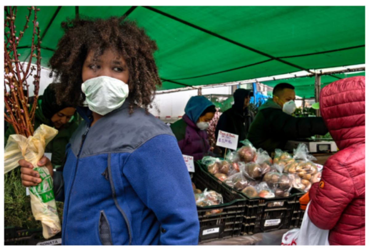
Stricter guidelines aim to prevent crowding, contamination and other hazards.

Some customers prefer greenmarkets to shopping inside during the coronavirus outbreak. Last week, rules were introduced to keep the markets safe.