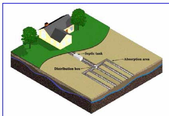
Figure 1. The basic design of an onsite sewage treatment system

Even if you've lived with an onsite sewage system all your life, you may be blissfully ignorant of the ticking time bomb in your backyard. And if you have moved from an urban area or community that provided water and sewer service, you may be bringing a water-luxurious lifestyle that is incompatible with an onsite sewage system. Another challenge is, in most cases, the septic tank and soil absorption field were already in place when you moved in