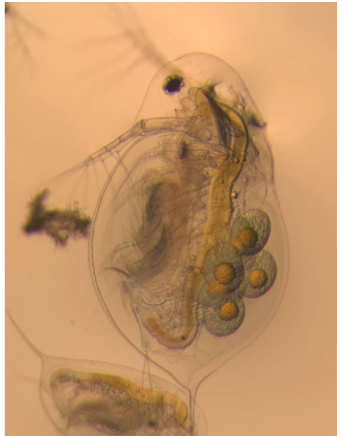
Daphnia under a microscope.

You may wonder why you will be testing the toxicity of salt. You've probably eaten salt today. It's found in most foods! An important concept to keep in mind is that depending on the dose, any substance can be a poison; in other words, the dose makes the poison. Although almost all forms of life require the ions found in salt, too much salt can be bad news. Our Daphnia species is adapted to freshwater ecosystems, which are typically 0.05% salt, so too much salt in the environment can cause reduced health and mortality. In contrast, ocean water is approximately 3.5% salt. Salt often makes its way into freshwater aquatic ecosystems because of its frequent use in winter road treatments, making it a relevant contaminant for us to study.