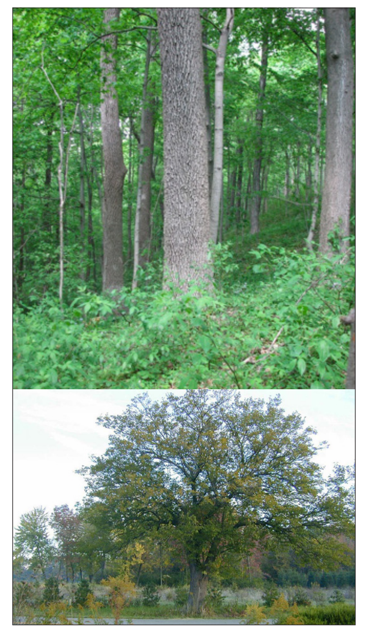
Figure 3. Well-formed and large timber trees (top) as compared to an open-grown landscape tree. (bottom)

Before comparing the lumber produced by urban and timber trees, it is worth understanding the nature of traditional wood manufacturing. The primary wood manufacturing industry is composed of sawmills and veneer mills that seek out traditional forest trees, which tend to be tall and straight and, when mature, produce large quantities of relatively uniform lumber and veneer. Few urban trees match their needs (Figure 3).