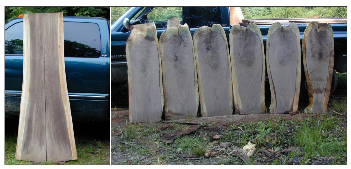
Figure 2. Book-matched walnut slabs (left) and also several pieces of figured walnut from a large crotch produced by a portable thin kerf band mill. Due to production costs, especially labor, most traditional mills will not produce these types of products.

damage from objects occasionally found embedded in trees, especially from trees in urban areas, is far less than in traditional mills. These important innovations can facilitate use of urban timber.