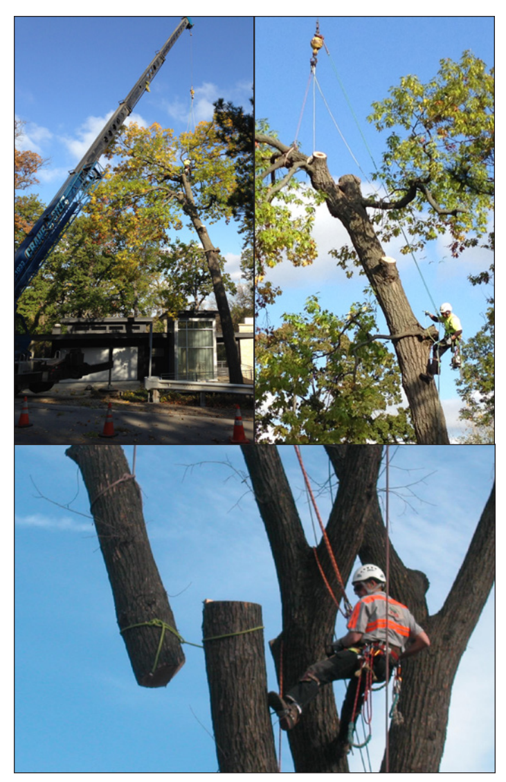
Figure 1. Removal of most urban trees requires specialized equipment and a skill set different from commercial logging skill. All of the tree—not just the trunk—must be removed.

Primary wood manufacturing is the milling of logs into lumber by sawmills. Secondary manufacturing makes lumber into finished products, such as furniture and cabinets. In both segments of the wood industry, processing equipment has changed greatly in the last two decades. Sophisticated, highly efficient, and mostly computerized machines now have the capability to massproduce wood products. Mass customization, where the