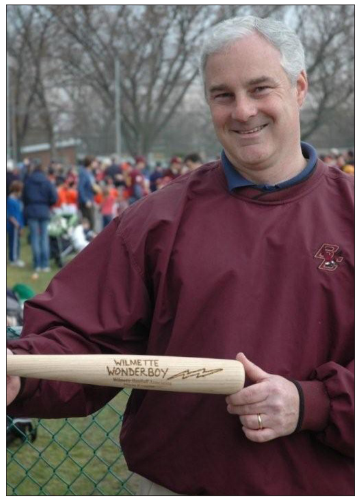
Figure 5. "Wilmette Wonder-Boy" baseball bat made from EAB-killed ash. Used with permission.

Urban wood can be described as "lumber with a zip code." The proximity to markets and the cultural values embodied in urban wood add value. On the other hand, variety in type and quality of urban lumber, the inconsistency in supply, and greater costs inherent in the harvesting and processing will likely keep urban lumber confined to specialty markets.