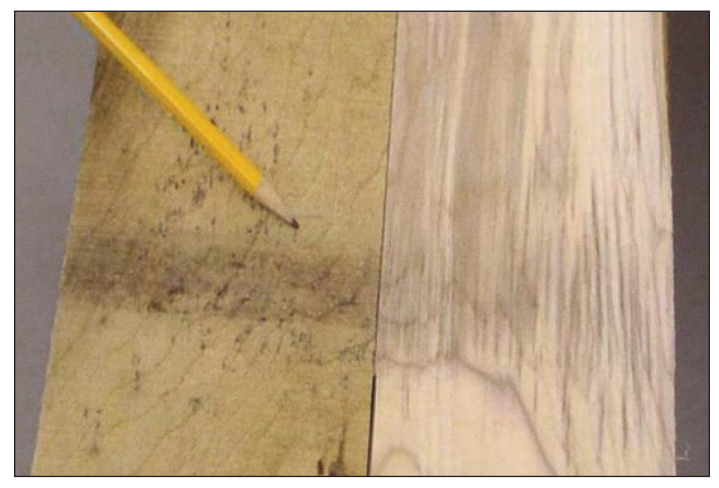
Figure 8. Oxidation stain in yellow poplar sapwood due to poor or slow drying conditions. A drying sticker mark is shown on the left along with general graying of the left half of an unsurfaced board. The right part of the figure shows stain in the other half of the board after surfacing.

Mineral stain, which results in olive to greenish-black or brown, blue, or purple discoloration in sapwood, is another factor to consider. The cause of mineral stain in other species is not well documented, but it is likely a response to mechanical damage, bird peck, or root damage to the tree. In commercial hardwood lumber, it is not considered a defect, but the amount is limited, depending on the grade. Yellow-poplar will sometimes turn a purplish-blue color that eventually, with exposure, turns the same brown color as aged heartwood. This discoloration has been related to wounding. The red oak lumber group can have excessive mineral stains (Figure 4). Some custom shops will prefer