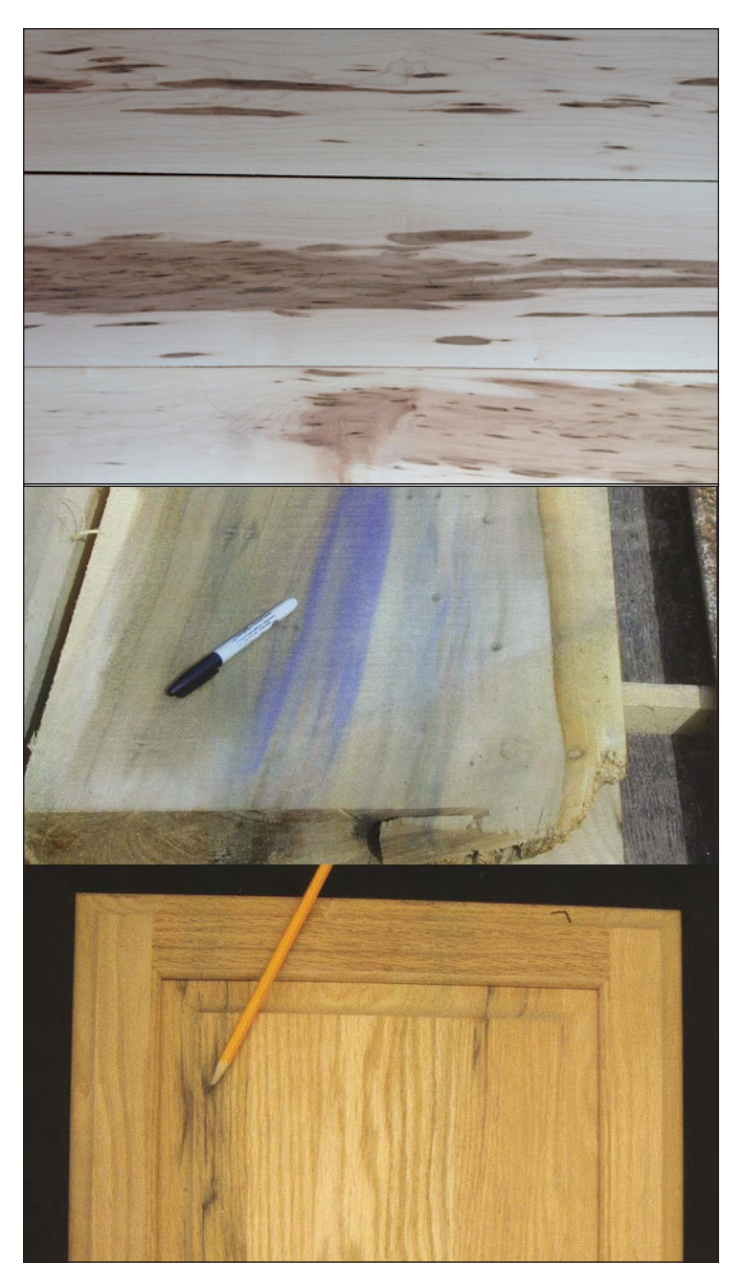
Figure 4. Mineral stain in hard maple (top), yellow poplar (middle) and in red oak (bottom). The white sapwood and brown heartwood of spalted maple is shown in Figure 9.

Increasing consumer demand for environmentally green and sustainable products offers opportunities for locally harvested and manufactured wood products. Consumers value local agricultural goods that can reconnect them with the land, as evidenced by the resounding popularity of farmers' markets. People develop attachments to landscape trees that are integrated into their community values and personal experiences. The devastation caused