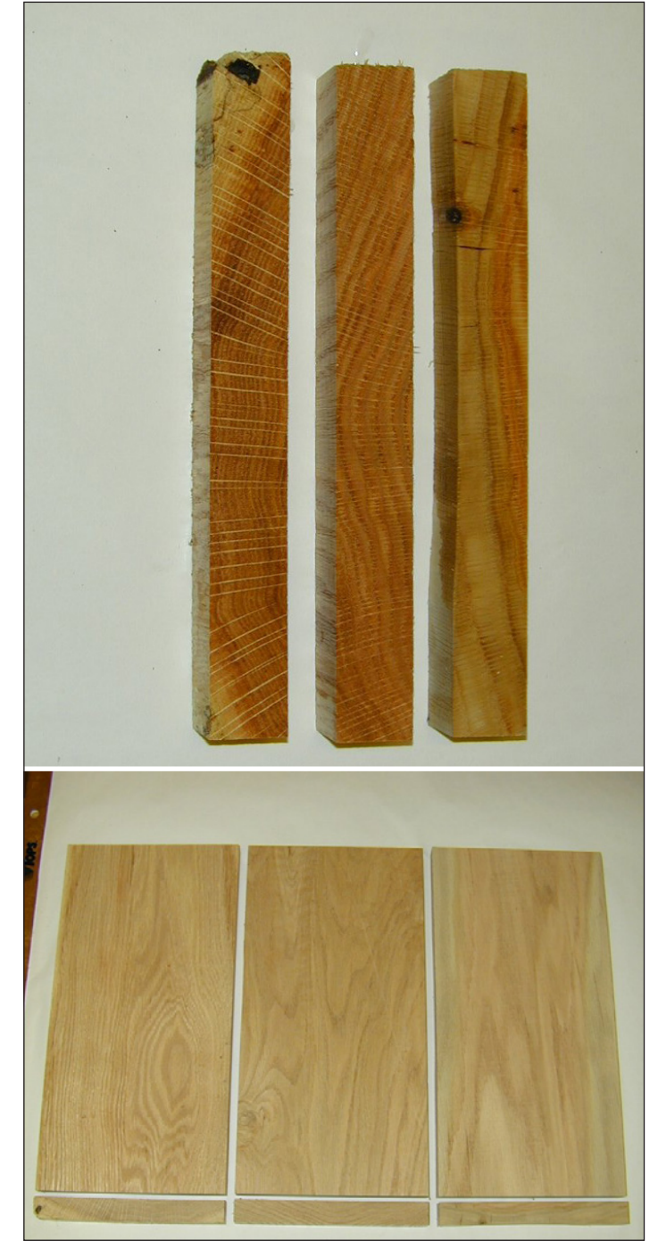
Figure 6. Slow, medium, and fast growth rates in the cross section of three different red oak boards (top). Flat sawn surfaces of the same three red oak boards. The bottom left piece shows a fine textured board and the right shows a more distinctive grain pattern due to wide growth rings.

Fast-growth, ring-porous types of wood such as oak, ash, elm, and others will have a more distinctive grain pattern when grown in open landscapes than will their slower-growth forest counterparts (Figure 6). The fast-growth material in ring-porous wood is denser, stronger, and