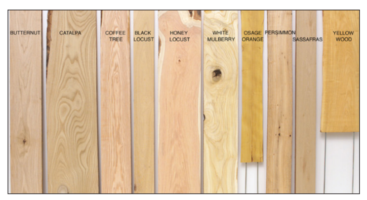
Figure 11. These are sample boards of several minor species that could be produced in small quantities from the urban forest.

In addition, numerous exotic species have been planted in the urban landscape and many develop into sawlogsize material. Examples include Siberian elm, ginkgo, and Chinese chestnut.