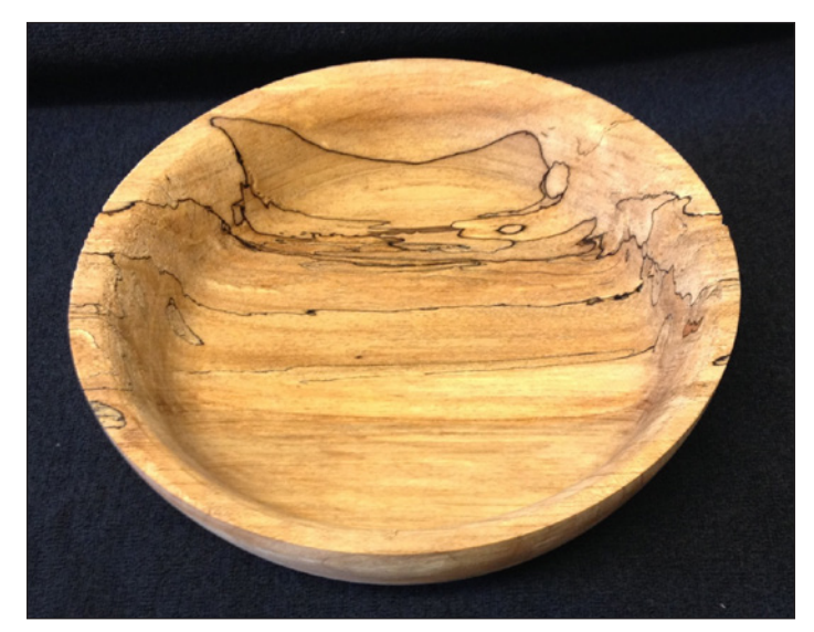
Figure 9. Spalted hard maple bowl.

this aberration. Because the development of mineral stain has been tied to wounding, in at least some cases, it seems intuitive that urban trees will likely show more of it.