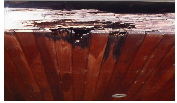
Figure 12. The decayed board ends are cypress sapwood while the sound end is heartwood. The joist is southern yellow pine sapwood.

<sup>2</sup> More than one species included, some of which may vary in resistance from that indicated.