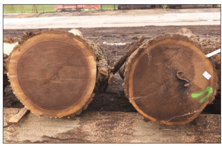
Figure 7. Very narrow sapwood in a walnut veneer log (right) as compared to a wide band in a more vigorous, fast-growth tree (left).

The sapwood is the light-colored outer part of a tree. This tissue is living and used by the tree for nutrient storage and transport. In species such as hard maple and ash, sapwood is usually preferred because of its light color. Young, vigorous, fast-growth trees will tend to have wider bands of sapwood. In the case of fast-growth walnut, the sapwood may be two to three inches wide, thus severely limiting the amount of dark heartwood available, particularly in smaller trees. On the other hand, in fast-growth, vigorous hard maple, a large band of more valuable sapwood should be available, providing the tree has not been wounded. Darker colored wood is generally found where a tree is wounded. Both faster growth rates and periodic wounding are to be expected more commonly in urban trees.