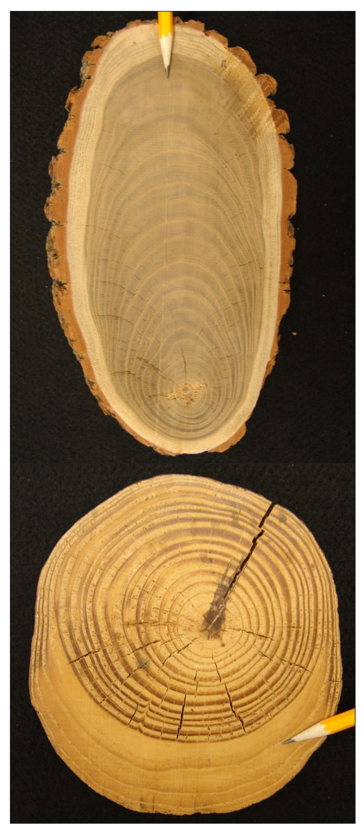
Figure 13. Tension wood is found in the upper side of leaning hardwood trees and branches. This is an extreme example (top). Compression wood is found on the lower side of leaning softwood trees (bottom).

Because urban trees are open-grown, subject to conflicts with infrastructure and cultivated through fertilizing, pruning, and other arboricultural care, abnormal wood may be more common in urban lumber. This likely increases the amount of degradation during the drying operation and also makes some material more difficult to work.