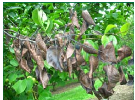
Figure 2. Pear shoots infected with fire blight turn black, giving the disease its name.