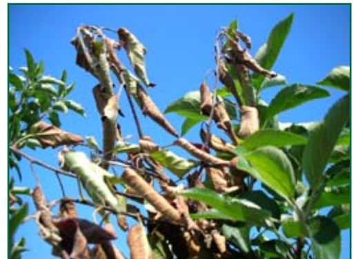
Figure 1. Young shoot tips wilt when infected, resulting in a characteristic “shepherd’s crook.”

Common apple varieties are regularly grafted onto dwarfing rootstock to reduce tree height. Many dwarfing rootstocks result in trees that are more susceptible to fire blight. Dwarfing rootstocks M.9 and M.26 on apples are particularly susceptible to collar and rootstock blight. The above-ground portions of the tree may not develop symptoms, while the susceptible rootstock is cankered. As the canker girdles the rootstock, the upper portion of the tree will develop symptoms of decline (smaller leaves, weak growth, early fall coloration). These infections are difficult to distinguish from another disease, Phytophthora collar rot.