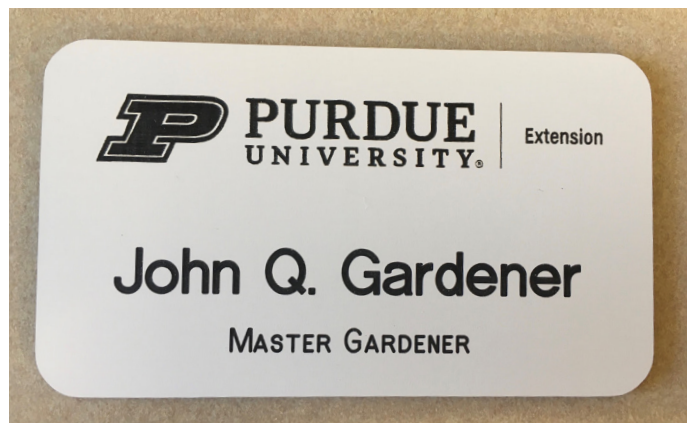
Purdue Extension Master Gardener Badge for the initial certification level.

Additional advanced EMG certification levels include Bronze, Silver, Gold, and Platinum. The Gold level further recognizes those who have volunteered 1,000, 2,000, 3,000, 4,000, and 5,000 hours and Platinum levels recognize volunteers contributing 6,000, 7,000, 8,000, 9,000, and 10,000 volunteer hours. EMGs will be awarded certificates and name badges for each level achieved through their volunteer activity and training.