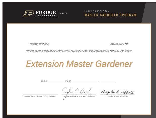
Purdue Extension Master Gardener Certificate for certified EMG level.

After completing the volunteer commitment of at least 40 hours, EMG Interns will receive, from Purdue University through their county coordinator, a certificate that verifies they completed the Purdue EMG Program requirements.