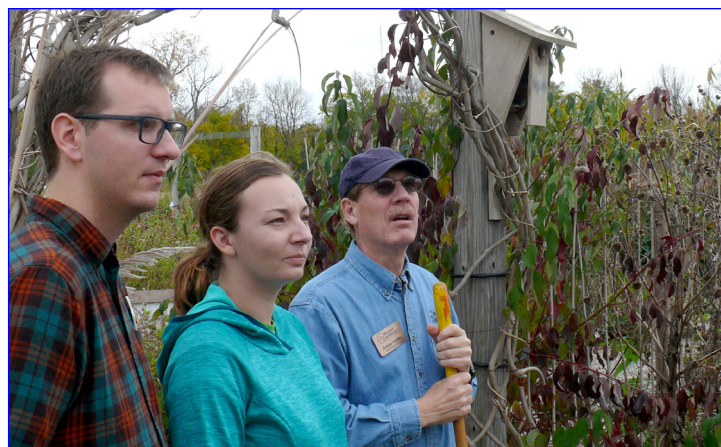
College of Agriculture Photo

Purdue University and the Purdue EMG Program reserve the right to immediately terminate any volunteer who demonstrates egregious behavior that rises to the level that termination is necessary for health and/or safety reasons, as determined by the Purdue Extension Area Director.