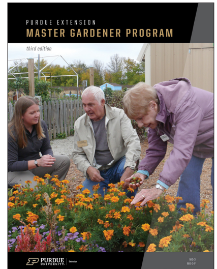
Purdue Extension Master Gardener Manual in print and digital versions.

Basic training participants receive a copy of the Purdue Extension Master Gardener Manual (available in print and digital formats), which is a comprehensive reference about many horticultural topics related to Purdue EMG Basic Training. This reference also includes questions EMGs may receive from the public with examples of appropriate responses. This manual will be a valuable resource for volunteers.