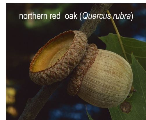
northern red oak ( Quercus rubra )