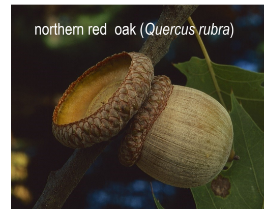
northern red oak ( Quercus rubra )