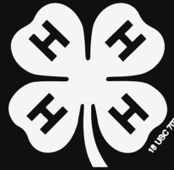
EXHIBIT HALL SPONSORS