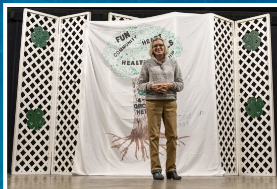
Sapphire Clover - 35 Years of Service