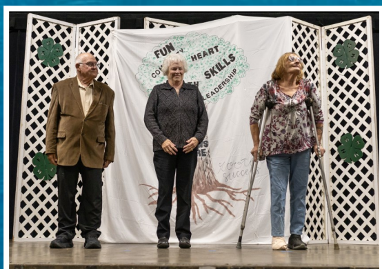
Diamond Clover - 40 Years of Service