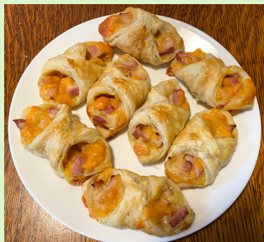
Served as an appetizer.