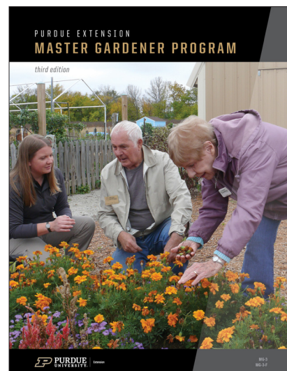
Purdue Extension Master Gardener Manual in print and digital versions.

Basic training participants receive a copy of the Purdue Extension Master Gardener Manual (available in print and digital formats), which is a comprehensive reference about many horticultural topics related to Purdue EMG Basic Training. This reference also includes questions EMGs may receive from the public with examples of appropriate responses. This manual will be a valuable resource for volunteers.