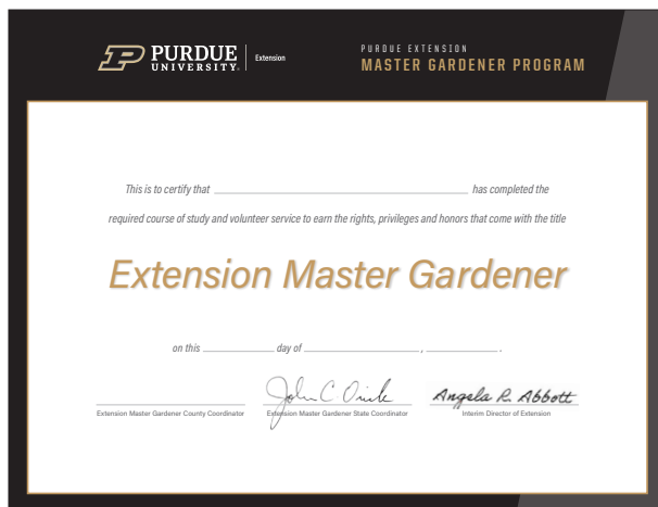
Purdue Extension Master Gardener Certificate for certified EMG level.

After completing the volunteer commitment of at least 40 hours, EMG Interns will receive, from Purdue University through their county coordinator, a certificate that verifies they completed the Purdue EMG Program requirements.