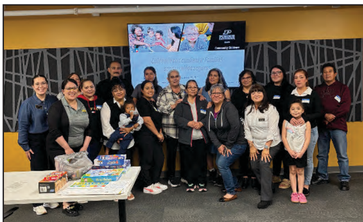
Group photo taken after Cuidando con confianza with all the providers in attendance.

The first session for this group focused on getting to know each other. The second session featured a training on HERO Story Time—a literacy-based program designed to help young children develop key social-emotional skills. HERO (Helping Every Child Reach Optimum Success) uses eight carefully selected storybooks aligned with the Search Institute's 40 Developmental Assets to nurture empathy, self-regulation, positive identity, and interpersonal skills. Providers learned how to integrate story-based activities and family engagement tools to create safe, stable, and nurturing environments for children. The program is a valuable tool for building resilience and supporting healthy development in early childhood settings. We are excited to continue growing this group and offering mentorship and a space for providers to lead and learn together.