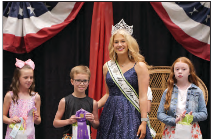
4-H participants during the 2024 Tippecanoe County 4-H Fair.