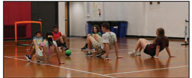
4-H youth play a game of crab soccer at Ag to Athletics.