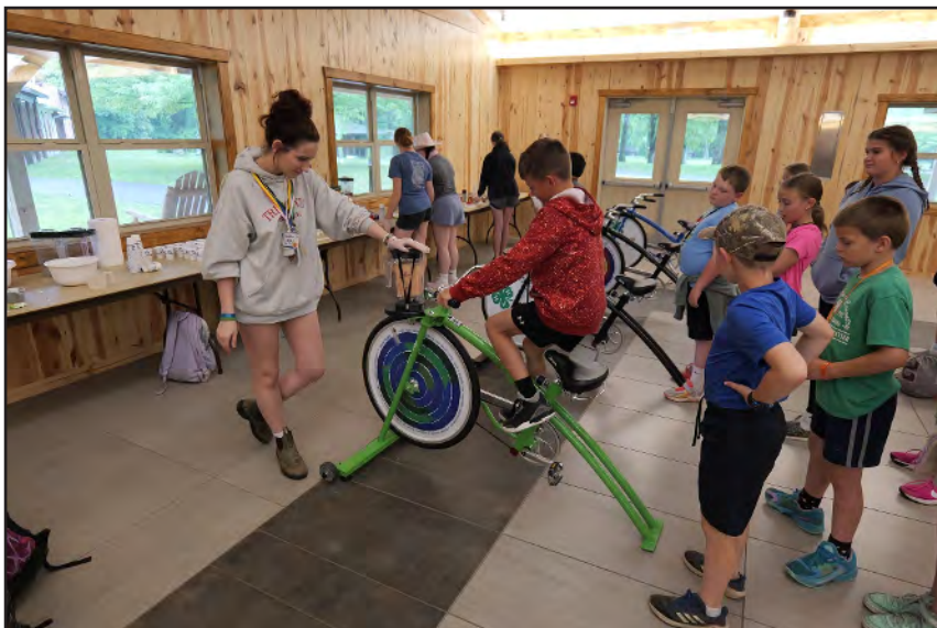
4-H youth enjoying the Blender Bike at 4-H Camp at Camp Tecumseh.

We also received great news; our office was approved for another year of the FAIRs Care Program! This program helps raise awareness about food insecurity while supporting Food Finders Food Bank through State Fair ticket sales during the fair. We're excited to continue this partnership and make an even greater impact in the year ahead.