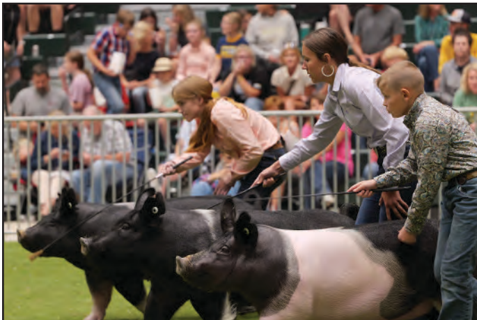
4-H participants during the 2024 Tippecanoe County 4-H Fair.