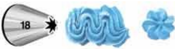
Tip #16 or #18 Star