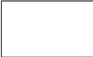
Horizontal Poster: CORRECT