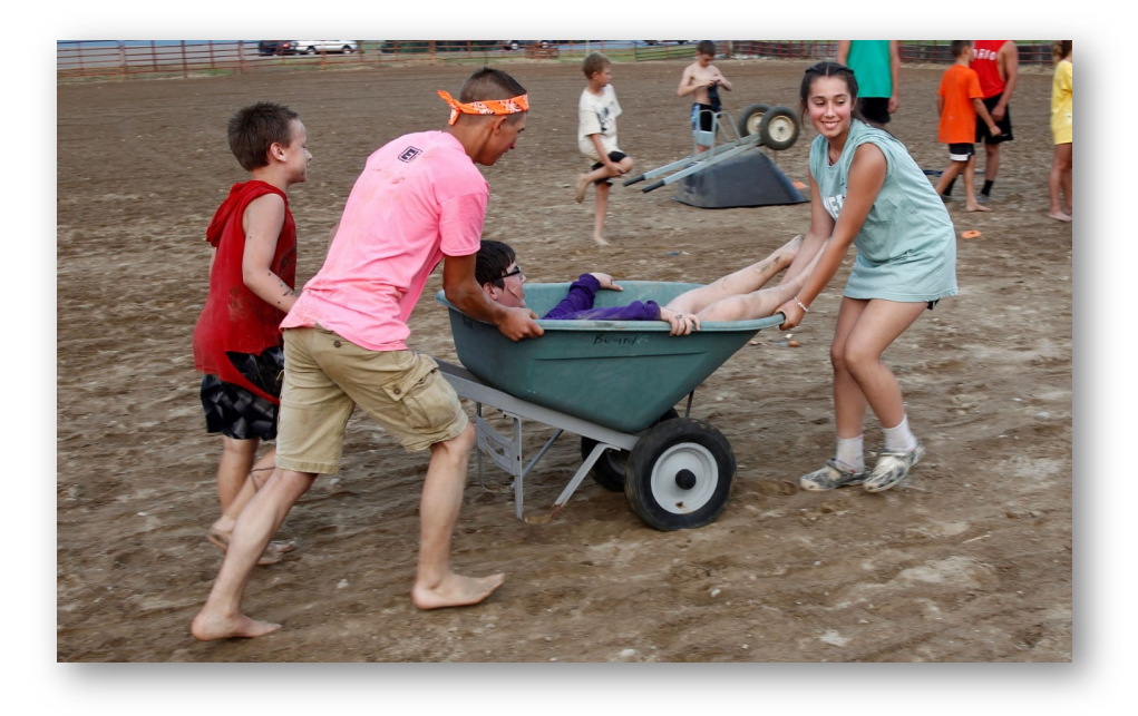
The 4-H Faceoff is hosted by the Steuben County 4-H Jr. Leaders annually.