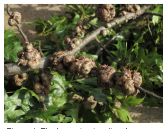
Figure 1. The horned oak gall maker can produce large galls with and without horns. In the older literature these galls were also called gouty oak galls.

Remove young expanding twig galls as soon as they are visible in the spring. Cutting off old, dried galls is not necessary. Applications of insecticides can kill leaf galls, but do not reduce the number of new stem galls produced. Research conducted to date has been promising, but slow going. Use of long-lasting products such as emamectin benzoate injections every two years in May have been shown to reduce the production of stem galls. But with a 33-month life cycle, it takes a long time to start seeing results. Don't expect miracles.