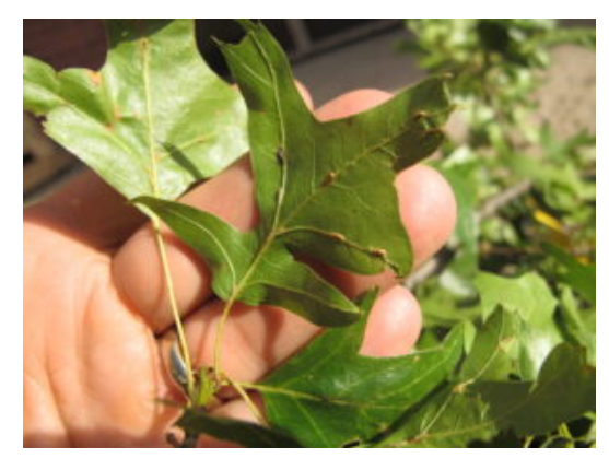
Figure 3. Eggs laid by the wasp produce galls on the midribs of leaves. Adults emerge from these galls in June to lay the eggs on twigs that produce galls and new adult wasps 33 months later.