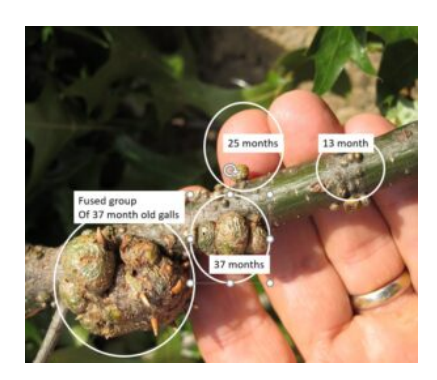
Figure 4. Small galls on the right side of the photo taken in late July are galls produced from females who laid eggs on twigs in June of the previous year (13 months). Galls of this size will not produce adult wasps. It has been 25 months gall makers laid eggs in these medium size galls. Adults will emerge the following April (33 months) to lay eggs in expanding oak leaves. These 37-month old galls had wasps emerge 4 months earlier in April.