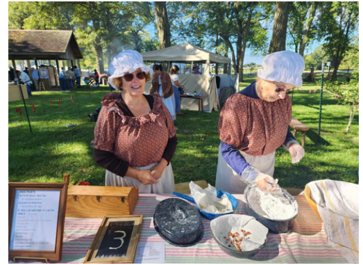
Noble County EH Club Members volunteering at Stones Trace Pioneer Festival September 2024

To maintain the highest ideals of home life; to count children the most important crops; to so mother them that their bodies may be sound, their minds clear, their spirits happy, their characters generous; to place service above comfort; to let loyalty to high purpose silence discordant notes; to let neighborliness supplant hatred; to be discouraged never; to lose self in generous enthusiasms; to believe one's community may become the best of communities; and to cooperate with others for the common end of a more abundant home and community life.