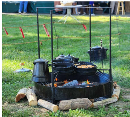
There are many service projects and craft days sponsored by the Extension Homemakers throughout the year.