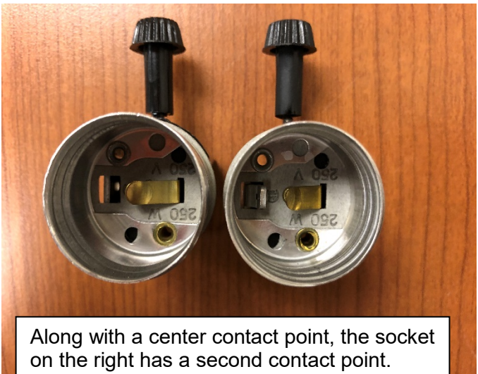
Along with a center contact point, the socket on the right has a second contact point. That is the three-way.