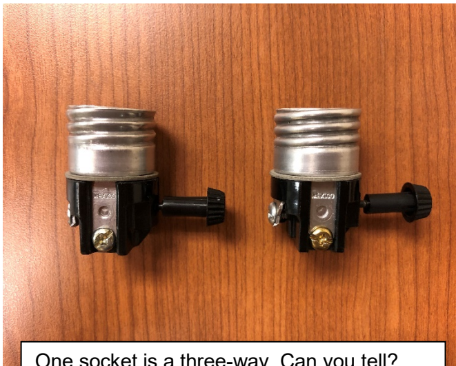
One socket is a three-way. Can you tell?