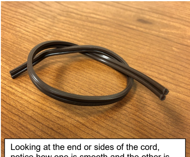
Looking at the end or sides of the cord, notice how one is smooth and the other is ribbed.