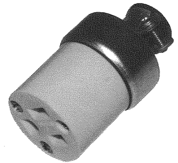
Three-Wire Connector Body with External Cord Clamp