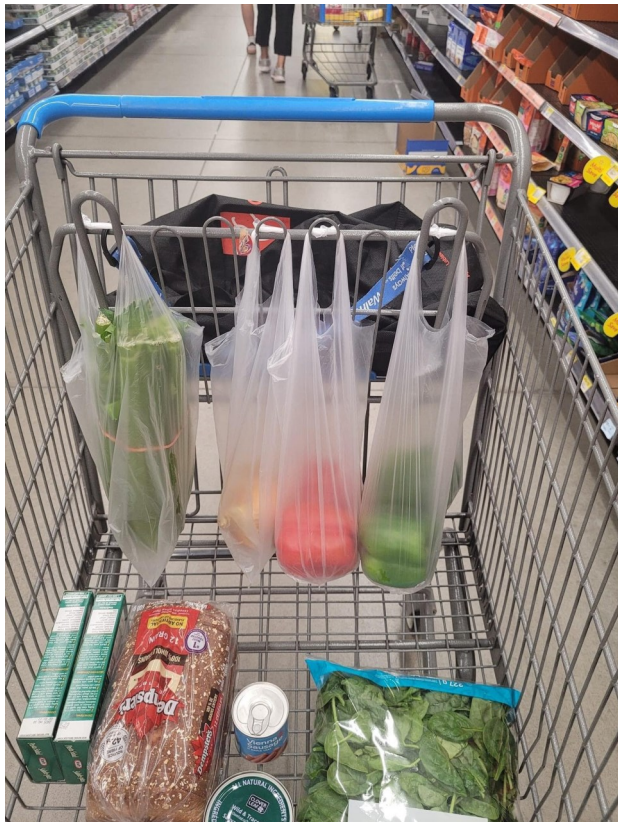
Grocery shopping tip!

Farmer's Day on Oct. 10th! - If you would like to help out at Farmer's Day we can definitely use the help! Kids are coming from the schools and we need lots of volunteers! Don't worry if you don't have a craft to do, we have plenty of stations that could just use a few extra hands. Right now the count is 253 kids from area schools and it's still early, this number can still go up! Contact Olivia if you are available to help, thank you!!