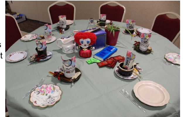
Table decorations for the tea party at Camp Elko.

The ladies and their hats for the hat judging contest at Camp Elko.