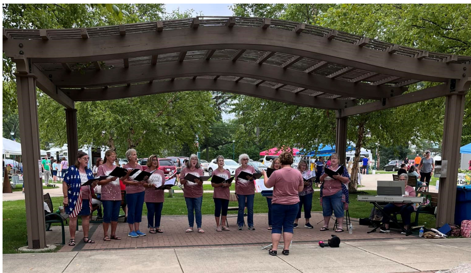
The Melody Makers preformed at the Plymouth Farmers Market on August 26th.