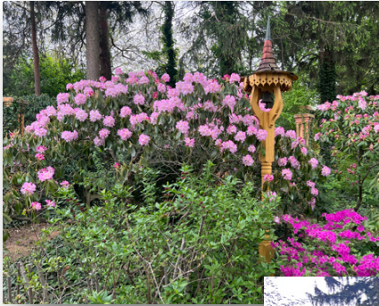
Some beautiful rhododendron photos from the garden of Maria Maule