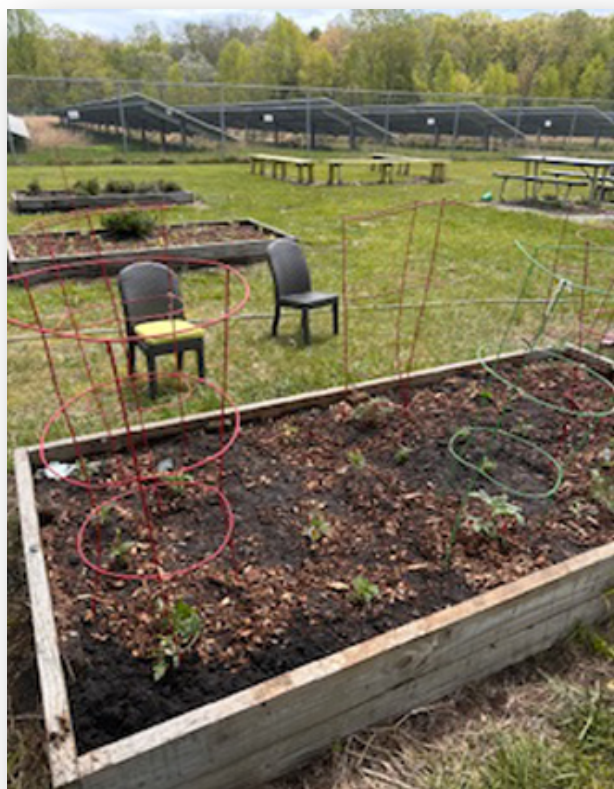
Ten beds planted with students