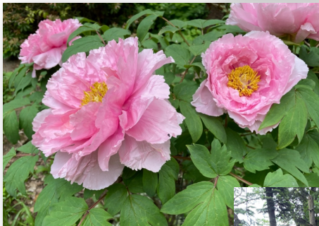
Beautiful tree peony and rhododendron in Donna Pouzar's garden