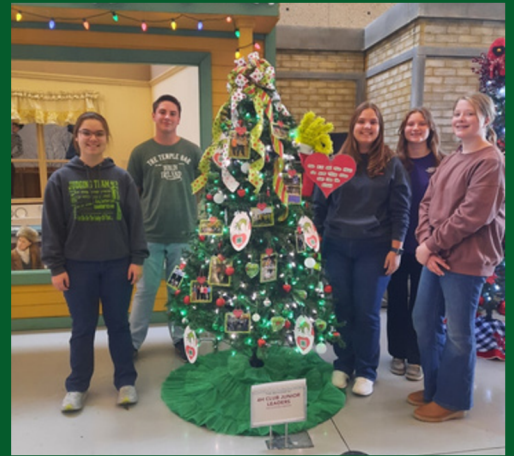
Jr. Leaders Christmas Tree decorated at the Indiana Welcome Center.