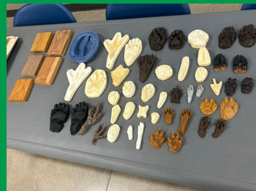
Forestry impressions displayed at our Kickoff.