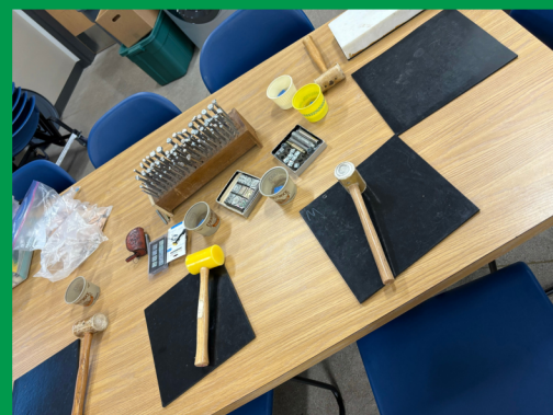
Leather making station from this year's 4-H Kickoff.