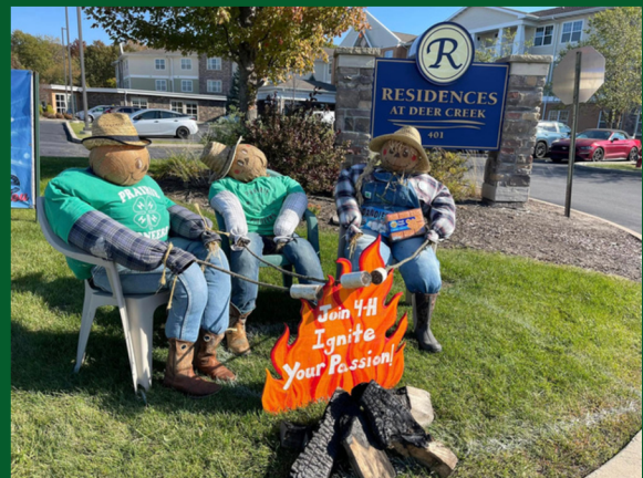
Prairie Pioneer 4H Club made scarecrows for Residences at Deer Creek's 12th Annual Scarecrow Contest.