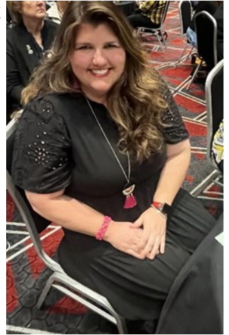
ABOVE: First Timer who created a club with 30 members already!

There will be many more pictures and stories I will share during the district