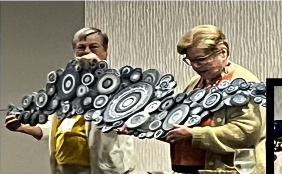
LEFT: Gorgeous, unique blue-toned table runner which won for state.