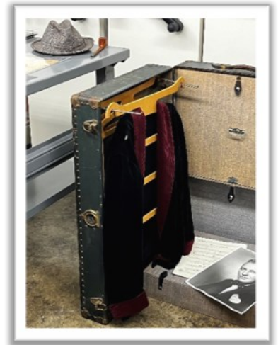
Bing Crosby's touring case. His original iconic pipe and hat are on the table at the top left.

Tuesday started with a wonderful full breakfast (and necessary coffee!) – even a made-to-order egg scramble with chef. Felt decadent not having to make anything or cook anything for a change! The annual business meeting was held at 9am in the main conference space. One look around the very full conference hall made you realize IEHA is still a very powerful and large organization! So many amazing ladies! Because I was wearing a first timer badge, I had many people come up to me during the event to welcome me, ask for feedback, and make sure I was having a good time.