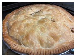
Figure 1: DeeAnna's Two-Crust Apple Delish Pie

cinnamon and butter, I found myself pausing to think about what homemaking truly means .