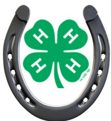
Jefferson County 4-H Horse and Pony Camp