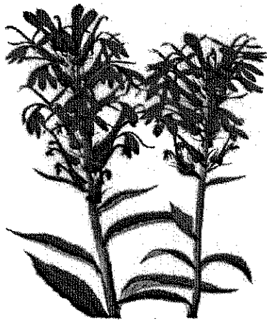
Cardinal Flower - Lobelia cardinalis