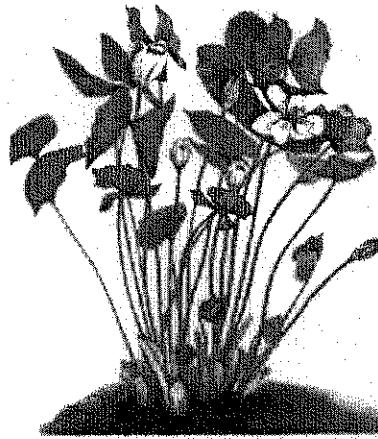
Trillium - Jeffersonia diphylla