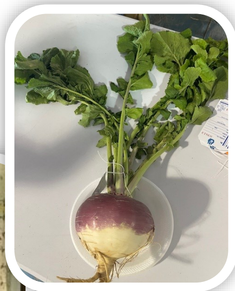
That's a HUGE turnip on a standard 9-inch Styrofoam plate. Wow!