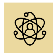
Leadership & Civic Engagement