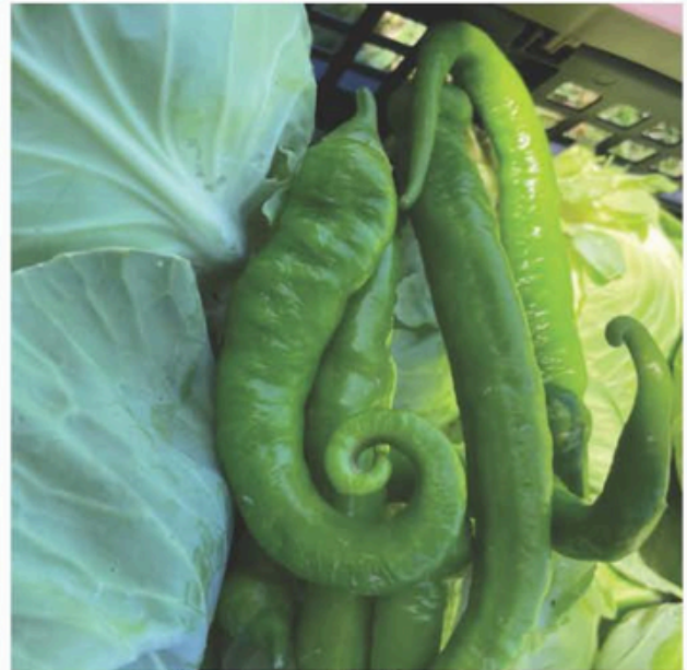
Peppers and cabbage harvested for donation from Our Community Garden - a Purdue Extension Floyd County project