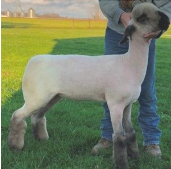
Oxford Purpose: Meat

A few different breeds of sheep would be: