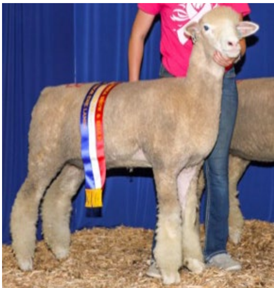
Columbia Purpose: Dual