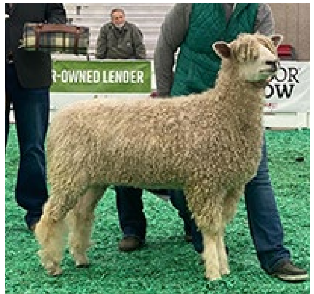
Lincoln Purpose: Wool