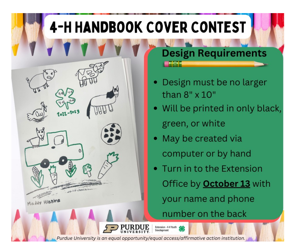
Show us your artistic skills in the 4-H Handbook Cover Contest!

Attention all artistic 4-H'ers! We are searching for a design to be the cover for the 2024 4-H Handbook! The design must be no larger than 8" x 10" and will be printed in only black, green and white. The design may be created on the computer or by hand. If you have a creative idea, turn it in to the Extension Office by October 13 with your name and phone number on the back. Your design could be the next Hamilton County 4-H Handbook cover!