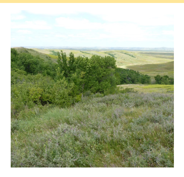
Picture from South Dakota ranch where cattle are adapted to a variety of non-Indiana plants

As I walk through the pasture, familiar plants are all around, crested wheat grass, lead plant, buck brush and sage. No, I am not in Northern Indiana, but on the prairies of my wife's family ranch in South Dakota where I have visited at least yearly for the past 39 years. There the cattle graze on totally different plants than what we find here. Just like the plants growing there represent species that can handle the rugged and cold environment, the cattle have adapted to know which of these plants to eat and which ones not to consume. How do they know? Because momma told them.