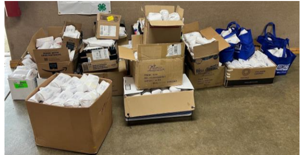
Boxes and bags full of protein unloaded from the trailer and ready to be divided among local pantries!

Thank you to all those who participated this year and we hope to grow these initiatives in years to come!