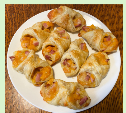
Served as an appetizer.