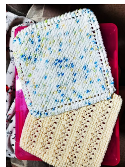
Not actual project