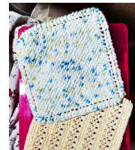
Not actual project