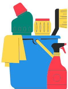
Exhibit Building Clean Up – Monday July 8th from 7 pm on. Junior Leaders need your help! Please sign up to help the Junior Leaders prepare the buildings on the grounds for 4-H Fair.