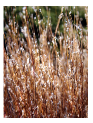
Above (L to R): 'Carousel' is a dwarf cultivar with stunning fall color & resistance to winter lodging.

The Perennial Plant Association has selected Little Bluestem as the 2022 Perennial Plant of the Year (PPoY). Perennials chosen through the PPoY program are suitable for a wide range of growing climates, require low maintenance, have multiple-season interest, and are relatively pest/disease-free.